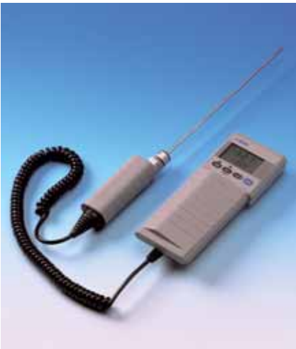
HMI41 with the HMP42 probe.