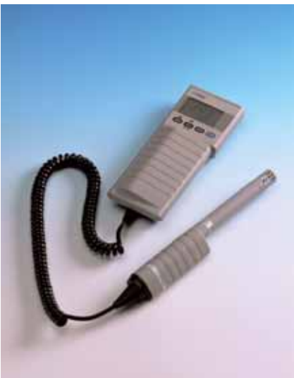
HMI41 with the HMP45 probe.