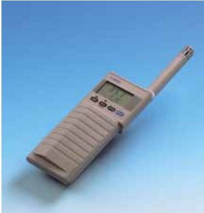
The HMI41 indicator with the HMP41 probe.